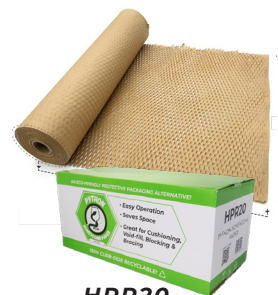
HPR20 20" Die-cut paper

VISIT WWW.WRAPTITE.COM OR CALL YOUR LOCAL SALES REP TO ORDER