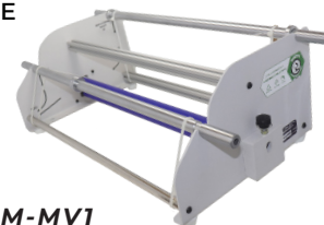
HPM-MV1 Manual Dispenser