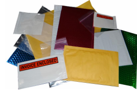
Bags, Mailers & PLE's

| PH: 440-349-5400 | FAX: 440-349-5432 | info@wraptite.com | www.wraptite.com