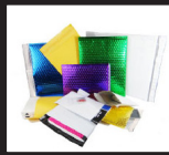
Poly Bags, Mailers & PLE's