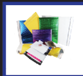
Bags, Mailers & PLEs