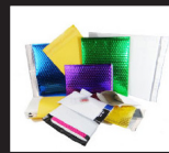
Poly Bags, Mailers & PLE's