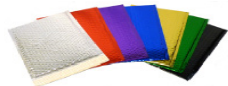
Available colors for metallic bubble mailers