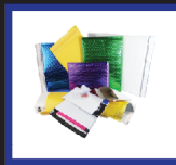
Bags, Mailers & PLE's